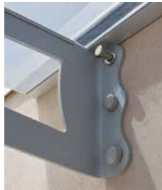
Complete wall mounting kit included