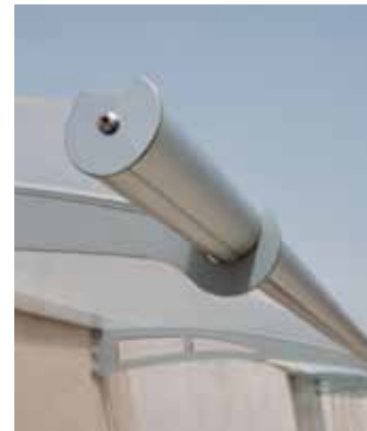
Anodized front gutter