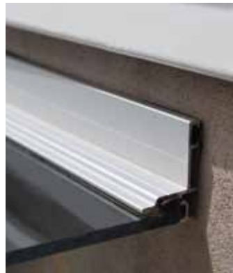
Back sealing gasket