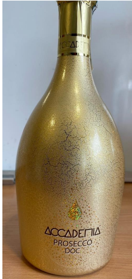
Prosecco Accademia (75cl)