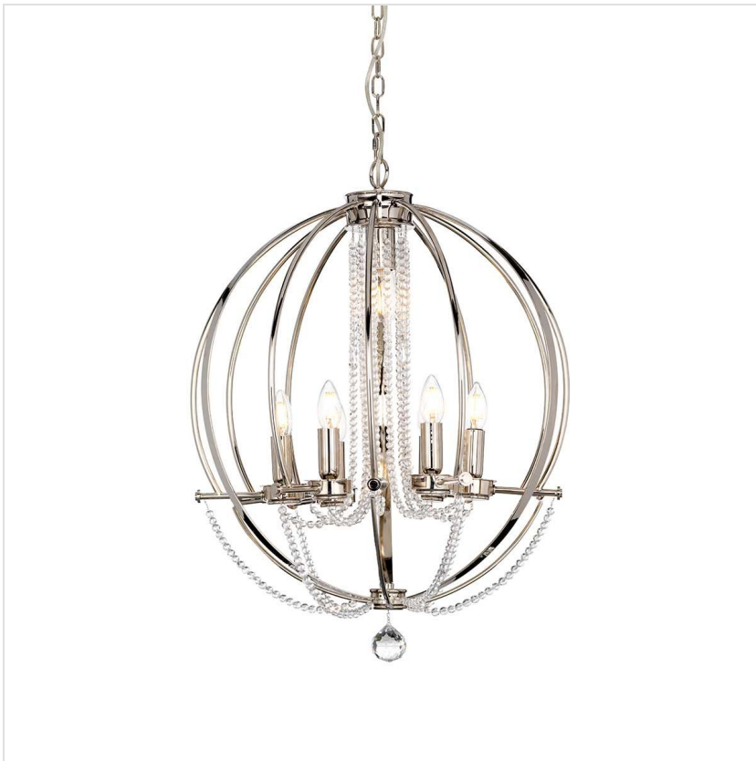
CASSIE7 Cassie 7 Light Chandelier - Polished Nickel Plated