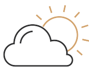
All Weather Fabric

Yes, the outdoor fabric range is specifically designed to be left outside all year round, you won't even need to put away your cushions.